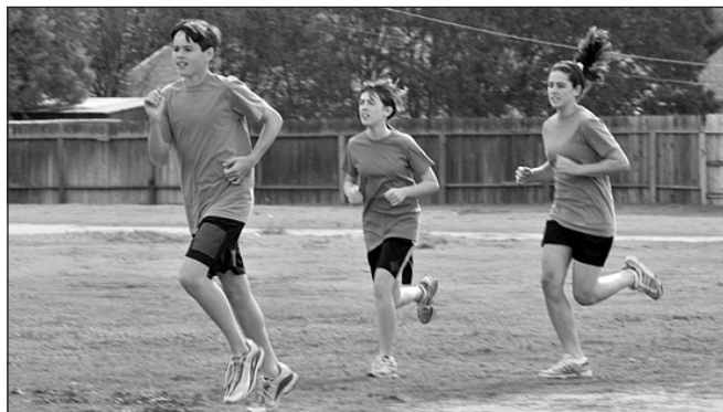
Figure 1. One-Mile Run

The equation used for estimating VO 2 max for the One-Mile Run is provided in Figure 2. The PFT data collection requirements, including the acceptable values, for the One-Mile Run are shown in Table 2.