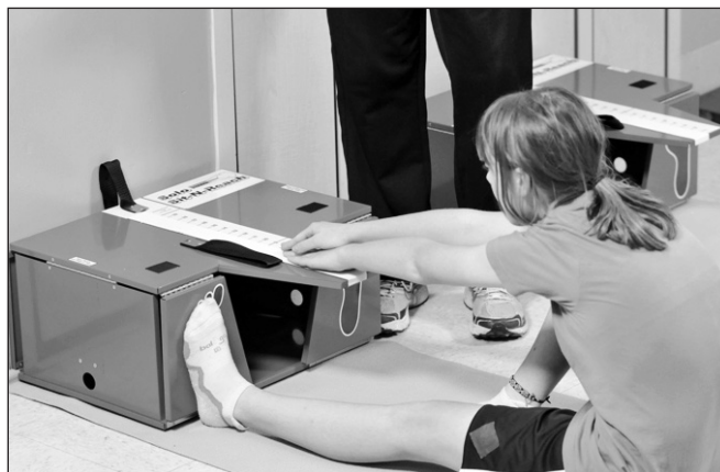
Figure 16. Back-Saver Sit and Reach