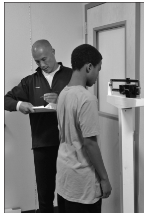
Table 8. (The height and weight data is also used in the estimation of VO 2 max for the One-Mile Run and 20m PACER.) The HFZs that apply to the Body Mass Index are provided in Table 9.

The equation used for estimating Body Mass Index is provided in Figure 10. The PFT data collection requirements, including the acceptable values, for Body Mass Index are shown in