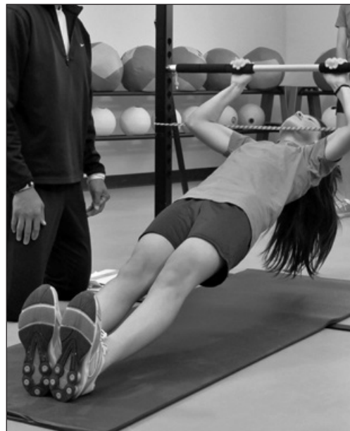
Figure 14. Modified Pull-Up

In the proper administration of the Modified Pull-Up, a student is allowed two form breaks with the first form break counting as a repetition. A student who commits two form breaks immediately after the start of the Modified Pull-Up should be scored 1.