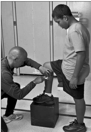
Figure 6. Skinfold Measurements

The equations used for estimating body fat for Skinfold Measurements are provided in Figure 7. The PFT data collection requirements, including the acceptable values, for Skinfold Measurements are shown in Table 5. The HFZs that apply to the Skinfold Measurement estimates of the percentage of body fat are shown in Table 7.