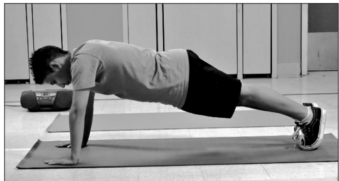
Figure 13. Push-Up

The PFT data collection requirements, including the acceptable values, for the Push-Up are shown in Table 14. The HFZs for the Push-Up are shown in Table 15.