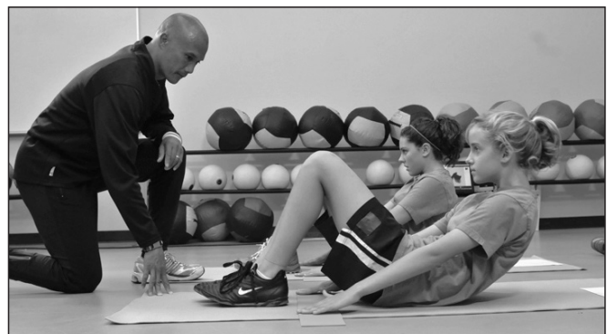
Figure 11. Curl-Up