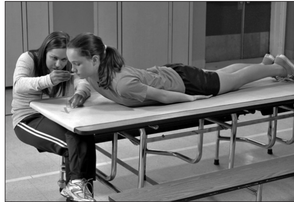
Figure 12. Trunk Lift

source of disability and discomfort in the United States. Although risks of developing back pain are greater with age, awareness and attention to trunk musculature at an early age is important to reduce future risks. The Trunk Lift (Figure 12) is the only test used to determine this area of fitness.