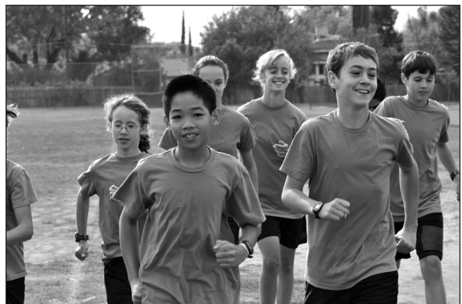
Figure 4. Walk Test

Walk Test. The Walk Test (Figure 4) is only for use with students who are ages 13 or older. This test estimates aerobic capacity from heart rate response to a one-mile walk. Students are instructed to walk one mile as fast as possible. Immediately after the walk, the heart rate is determined. This heart rate (heart beats per minute) is used along with the total walk time (minutes and seconds) and the weight of the student to estimate aerobic capacity. Students who do not finish the Walk Test should be given a time of 59 minutes and 59 seconds. For these students, this test will be scored Incomplete and reported as Needs Improvement.