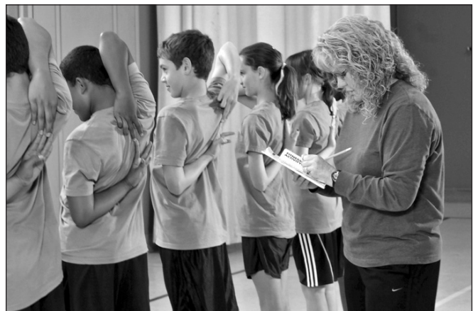
Figure 17. Shoulder Stretch